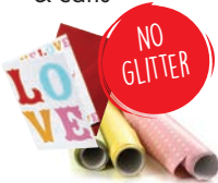
Greeting cards & wrapping paper