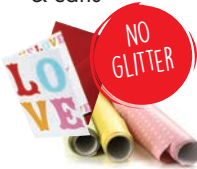
Greeting cards & wrapping paper