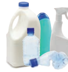
Plastic bottles (LEAVE LIDS ON)

Where possible present cardboard inside your pink sack to keep it dry. Small amounts of empty cardboard boxes will be collected if they are all flattened and presented beside your pink sacks.